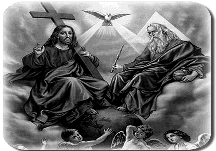
The Most Holy Trinity

Email: hghostchurch@gmail.com Website: holyghostparish.wikispaces.com Like us on Facebook: www.facebook.com/hghostchurch